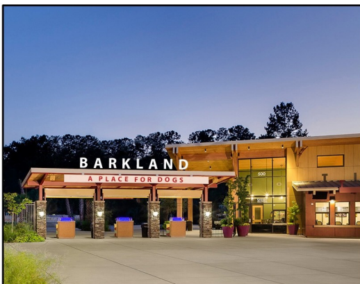
Photo for illustration purposes only. Not actual entrance.

Barkland will be a huge grassy compound filled with trees and encircled by paved walking paths. There will be ample separate fenced play areas for large and small breeds, each filled with fun and challenging components: dog par courses with hoops, bridges, tunnels, and other elements that foster inquisitive play; broad expanses to allow for ball or Frisbee chasing or just running freely; separate fenced wet play areas for wading or swimming, grassy mounds just for lounging, dozens of leafy trees for wilderness exploration, and strategically located water stations, shade structures, and comfortable park benches scattered throughout the park.